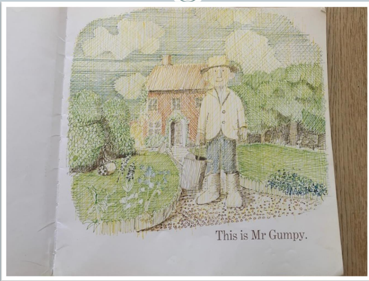
This is Mr Gumpy.